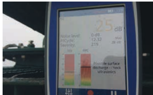
UltraTEV® Plus 2 reading showing the fault at site

The use of UltraTEV® Plus 2 helped to prevent loss of generation income.