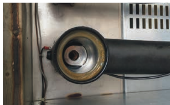
Partial Discharge identified